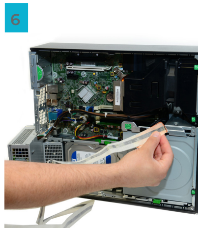
6 Fix the copper foil to your grounding point.