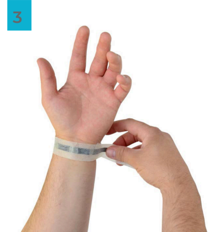
3 Place the tacky side on wrist.