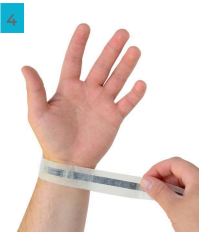
4 Ensure wrist is covered and the black conductive strip is against the skin.