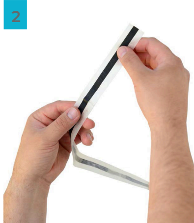
2 Peel back to reveal adhesive layer.