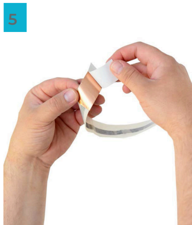
5 Peel back to reveal copper foil layer at the other end.