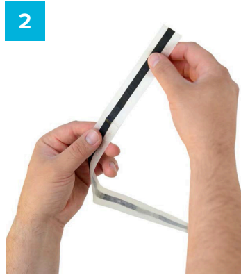
2 Peel back to reveal adhesive layer.