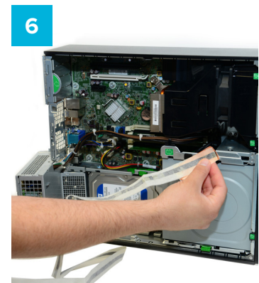
6 Fix the copper foil to your grounding point.

To request a quotation or for more information, please call +1 512-580-4220 email sales@antistat.com or visit www.antistat.com