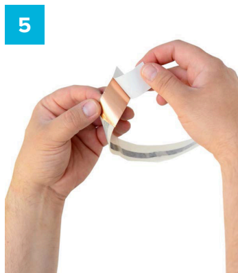
5 Peel back to reveal copper foil layer at the other end.