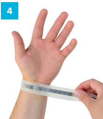
4 Ensure wrist is covered and the black conductive strip is against the skin.