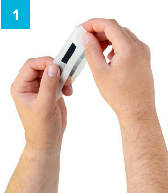
1 Remove wrist strap from external packaging.