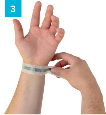
3 Place the tacky side on wrist.